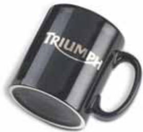
TRIUMPH LOGO BLACK MUG M2182606