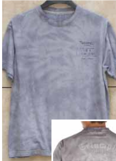
STUNT TEAM Grey Sizes S - XXL INT