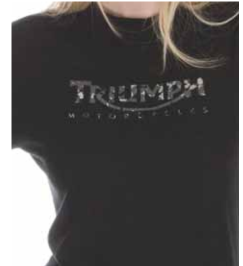
CAMO LOGO Black - Long sleeve Sizes XS - 3L INT