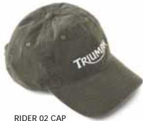
RIDER 02 CAP M9392608