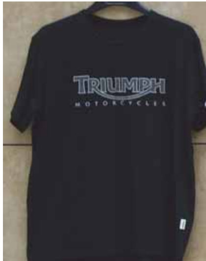
LOGO Black Sizes S - XXL INT