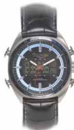
ANALOGUE DIGITAL 42mm stainless steel case Black leather strap 5 ATM