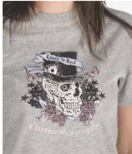
TRIUMPH LOVES TO ROCK Grey Marl Sizes XS - 3L INT