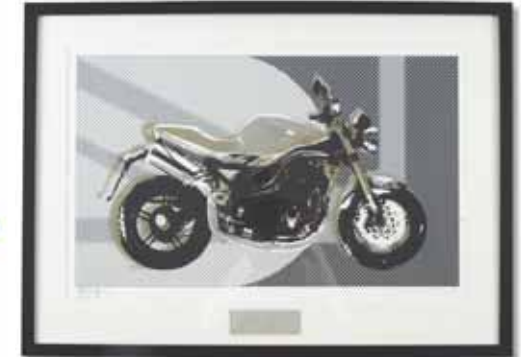
SPEED TRIPLE PRINT