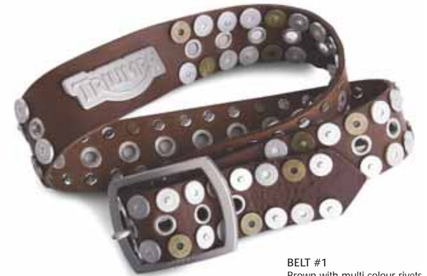
BELT #1 Brown with multi colour rivets