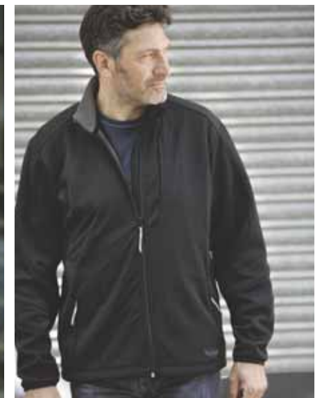
RAT TRI-THERMO FLEECE Black