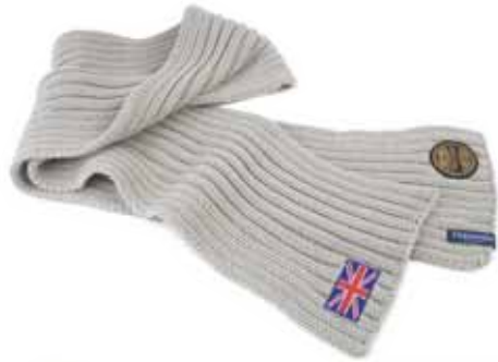
SCARF 170cm x 17cm M8801208