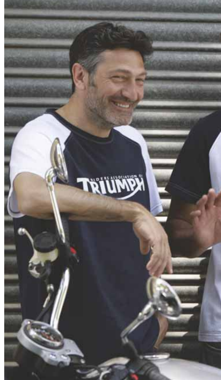
RAT T-SHIRT Navy Sizes S - XXL INT