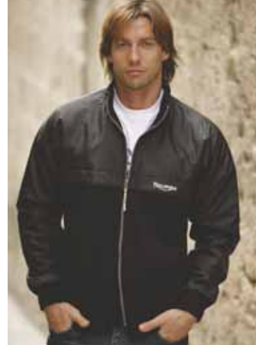
URBAN ZIP THRU Black Sizes S - XXL INT