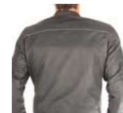
MODERN CLASSIC REVOLUTION JACKET Waxed cotton water repellent outer fabric Removable CE95 shoulder and elbow protectors Hidden Polycordura panels in shoulder and arms for extra protection Stitch detailed back logo 3M® night reflective back piping Option to fit fleece neck warmer Waist connection zipper supplied