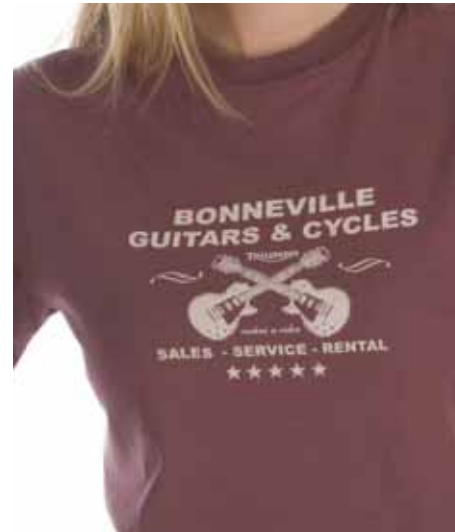
BONNEVILLE GUITARS Plum Sizes XS - 3L INT