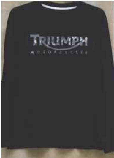
CAMO LOGO Black Sizes S - XXL INT