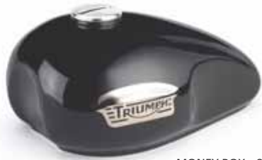
MONEY BOX - CERAMIC