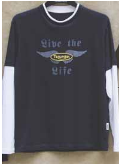
2 IN 1 Black Sizes S - XXL INT