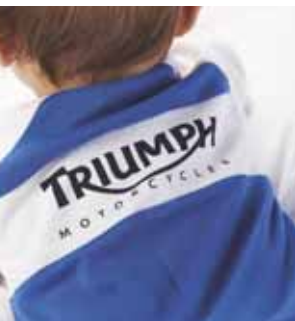
SLEEPSUITS - PACK OF 2 White/Blue