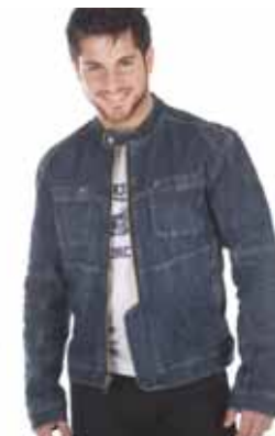
MODERN CLASSIC DENIM JACKET Ring-spun washed denim outer fabric *Keptec® reinforced shoulder and elbow panels