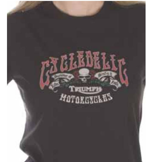
CYCLEDELIC Black Sizes XS - 3L INT