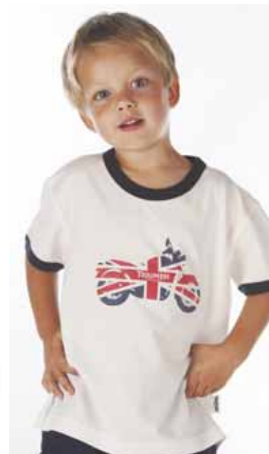
BONNIE BIKE Ecrú