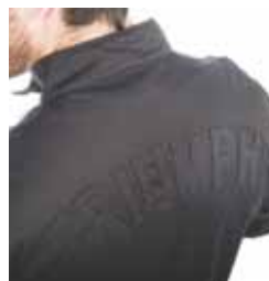
CAMO STRIPE ZIP THRU Black Sizes S - XXL INT