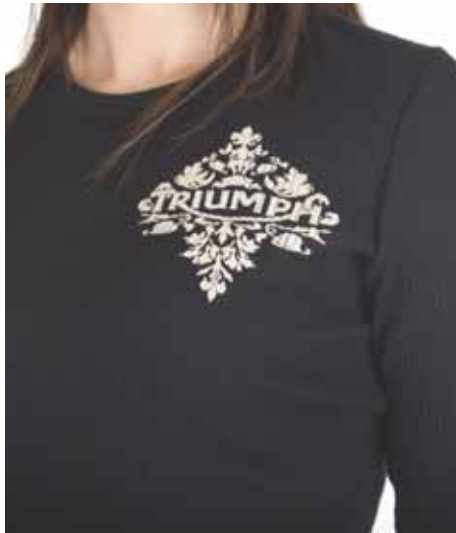
STRETCH RIB Black - Long sleeve Sizes XS - 3L INT