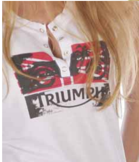
SNAP VEST White