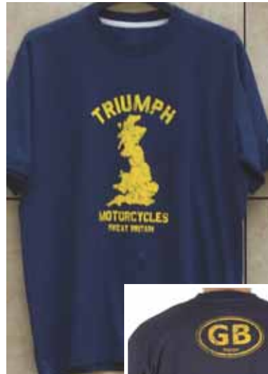
GB Navy Sizes S - XXL INT