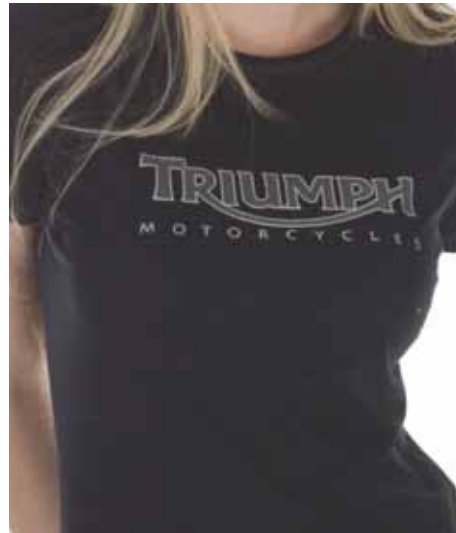
LOGO Black Sizes XS - 3L INT