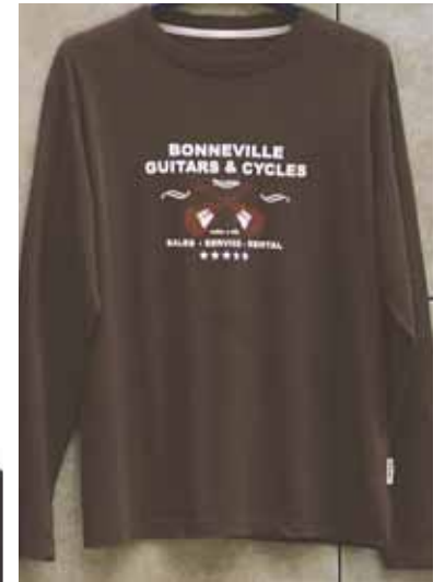
BONNEVILLE GUITARS Brown Sizes S - XXL INT