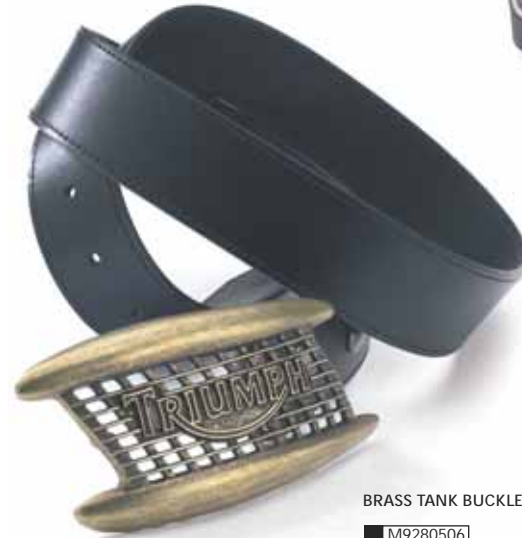
BRASS TANK BUCKLE M9280506