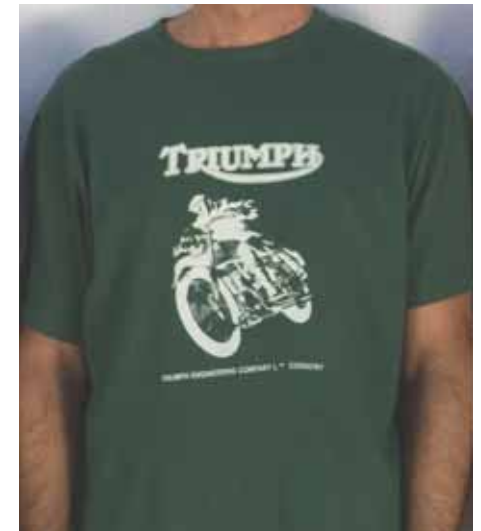
DECO #2 Racing Green Sizes S - XXL INT