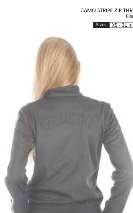
CAMO STRIPE ZIP THRU Black