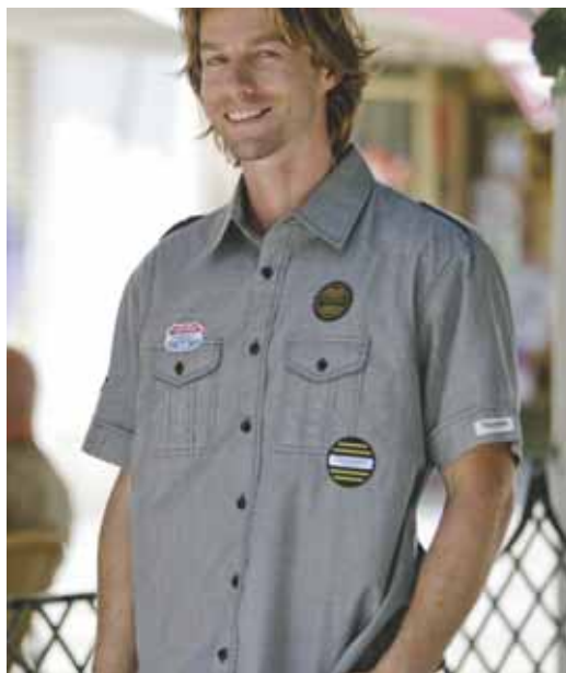
FASHION SHIRT #4 Grey Slim fit Sizes S - XXL INT