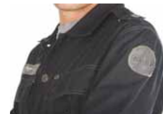
OVERSHIRT Black Sizes S - XXL INT