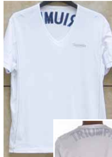
V NECK White Sizes S - XXL INT