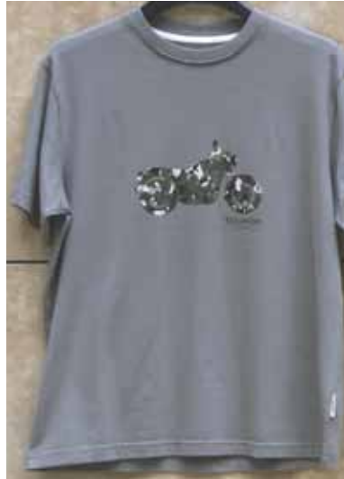
CAMO BIKE Green Sizes S - XXL INT