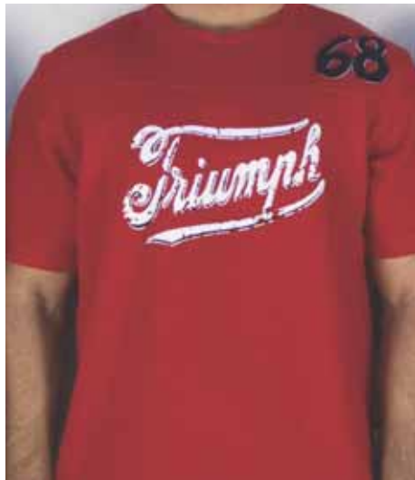
SIXTY8 Red Sizes S - XXL INT