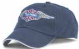
UNION JACK WING CAP M9392405