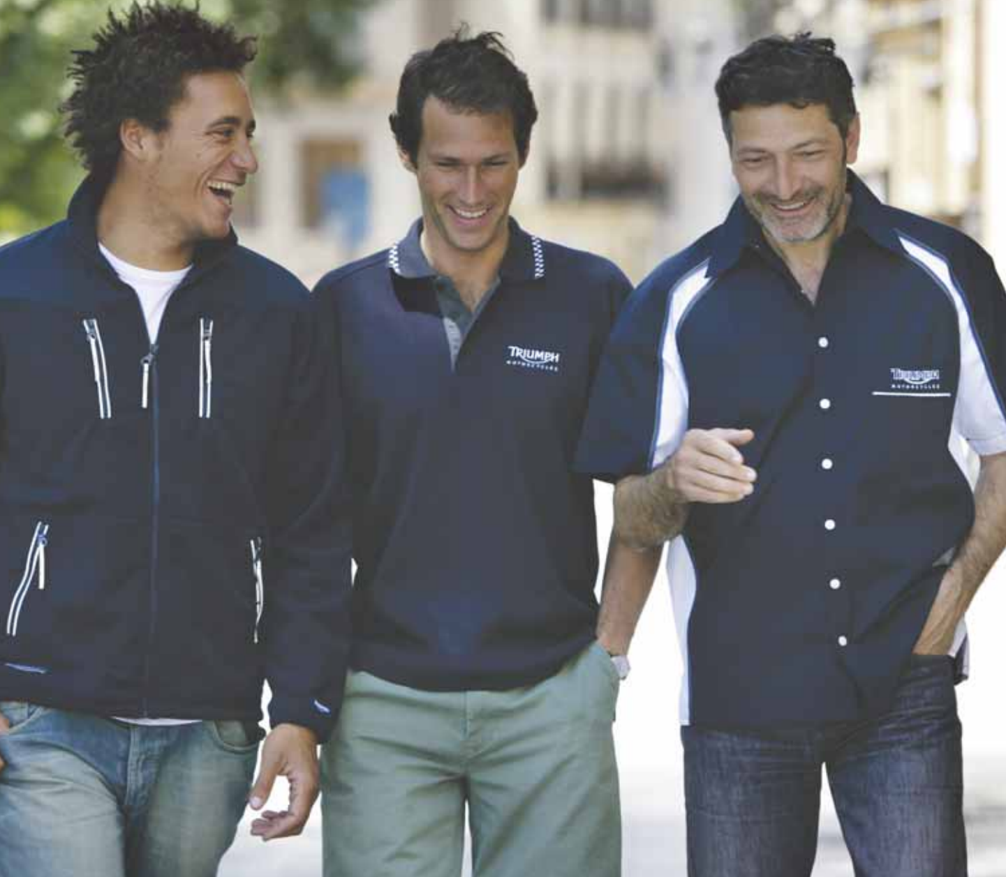
TEAM FLEECE Navy Sizes XS - XXL INT