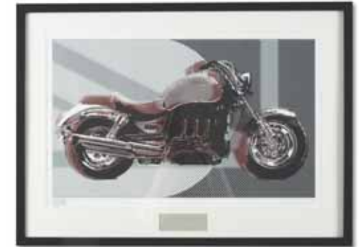
ROCKET III PRINT