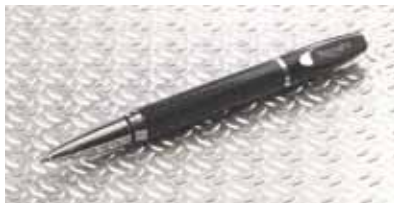
CARBON BALL POINT #2 M8000306