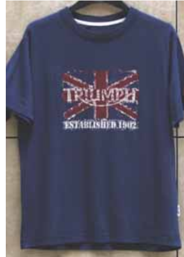
EST 1902 Navy Sizes S - XXL INT