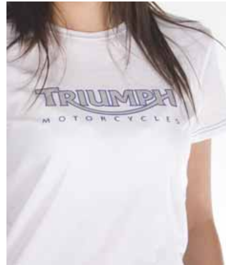
LOGO White Sizes XS - 3L INT