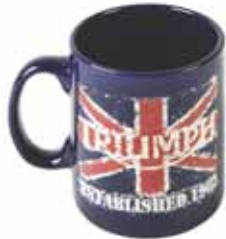
EST 1902 MUG M2183008