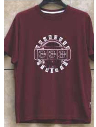
GAMBLING Burgundy Sizes S - XXL INT