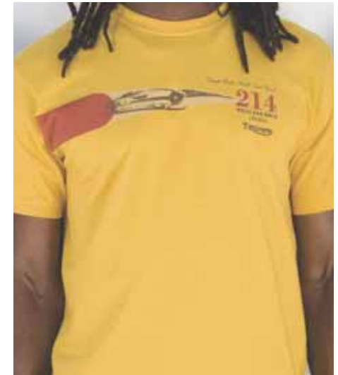
LAND SPEED RECORD Mustard

'Land Speed Record' is from the range of Triumph vintage sixty8 T shirts.