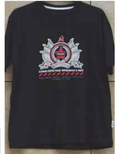
RUSSIAN IMPORTER Black Sizes S - XXL INT