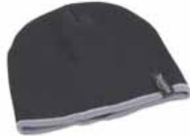
BLACK BEANIE M8801408