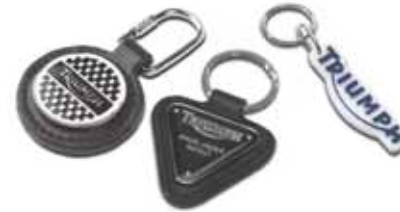
CHEQUER KEY FOB