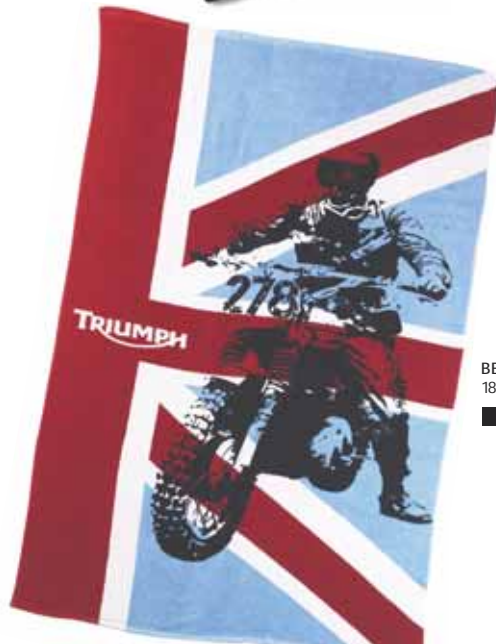
BEACH TOWEL 180cm x 102cm M9360006