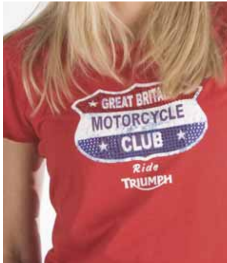
MOTORCYCLE CLUB Red