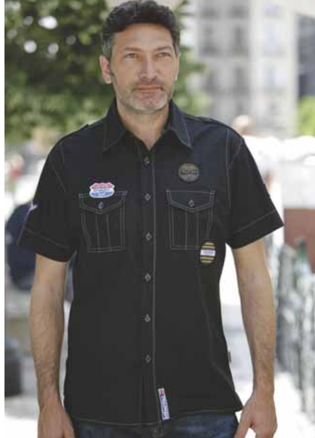
FASHION SHIRT #4 Black Slim fit Sizes S - XXL INT