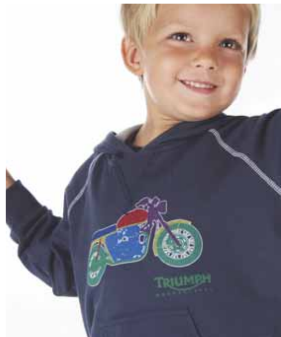
HOODIE #1 Navy