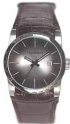
SPORTS CLASSIC II 42mm stainless steel case Brown leather strap 10 ATM