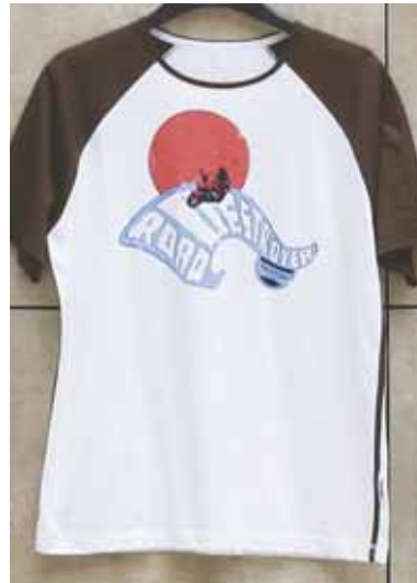
ROAD DESTROYER Ecru/Brown Sizes S - XXL INT