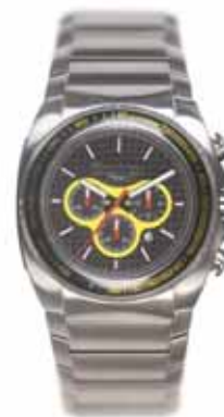
CARBON CHRONO 4 38mm stainless steel case Stainless steel strap Carbon Fibre Face 5 ATM