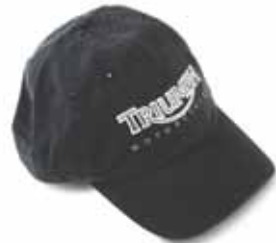
BLACK LOGO CAP M9392808