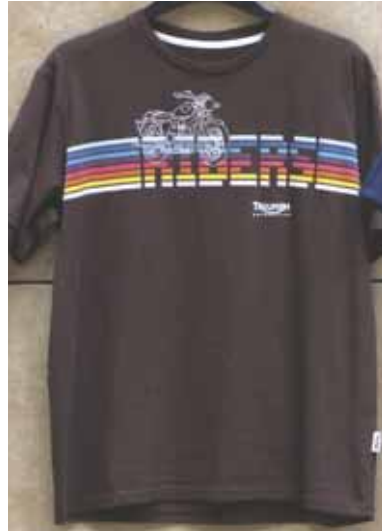
RIDERS STRIPE Brown Sizes S - XXL INT