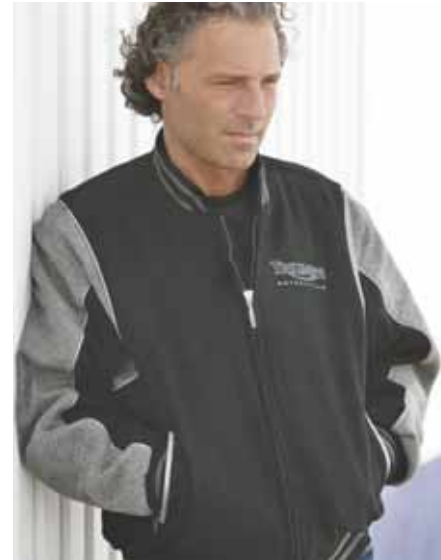
TEAM COLLEGE JACKET Melton Body Large leather back logo Sizes XS - XXL INT