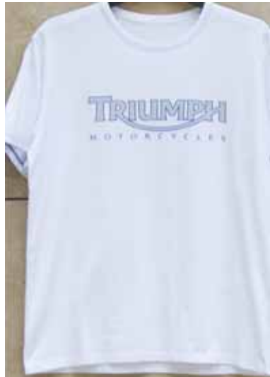
LOGO White Sizes S - XXL INT