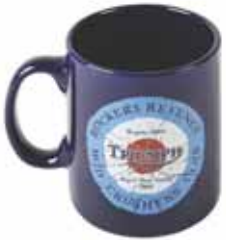
MOD CRUSHERS CLUB MUG M2183108