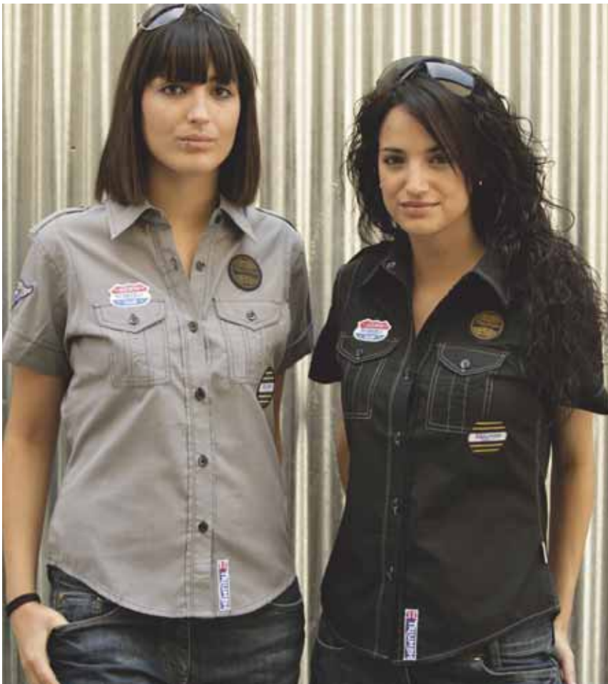
FASHION SHIRT #4 Grey or Black

The range includes clothing with a high level of technical performance. Tri-Dri allows perspiration to wick away from the body.