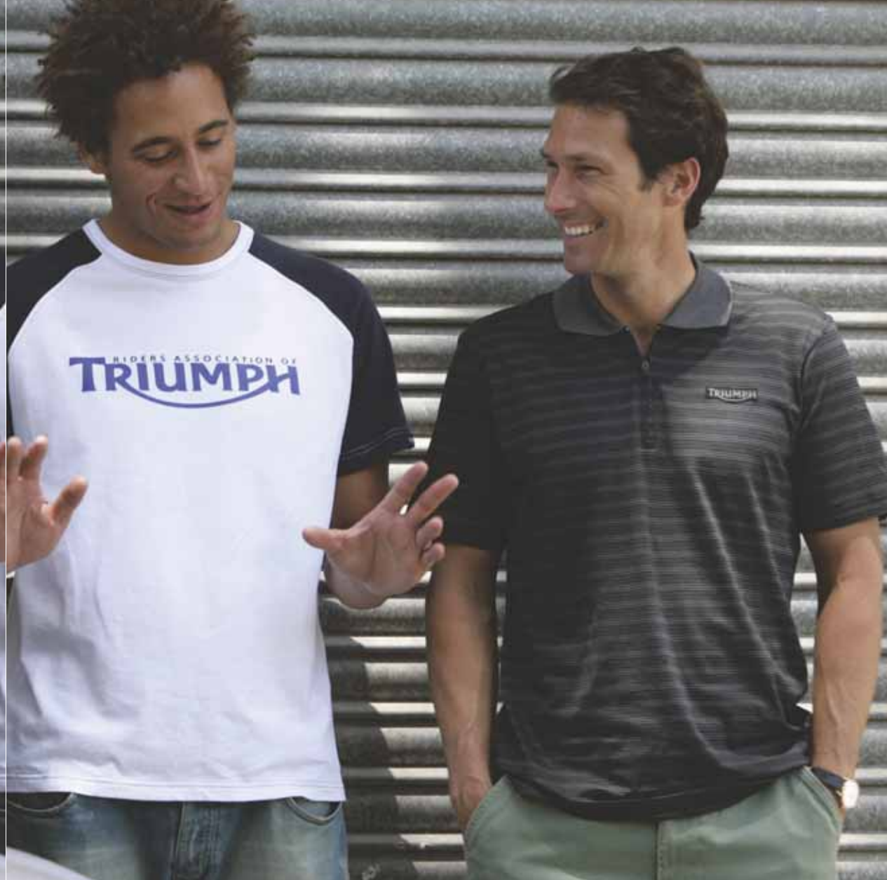
RAT T-SHIRT White