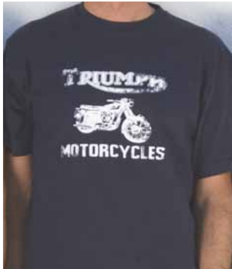
DYLAN Navy Sizes S - XXL INT