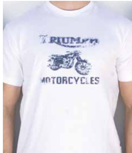
DYLAN White Sizes S - XXL INT