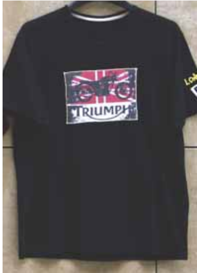
PUNK Black Sizes S - XXL INT