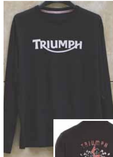
TRIUMPH RACING Black Sizes S - XXL INT