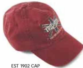
EST 1902 CAP M9392708