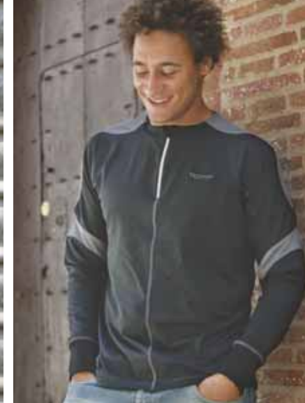
RAT TRI-DRI MENS PERFORMANCE TOP Black/Grey