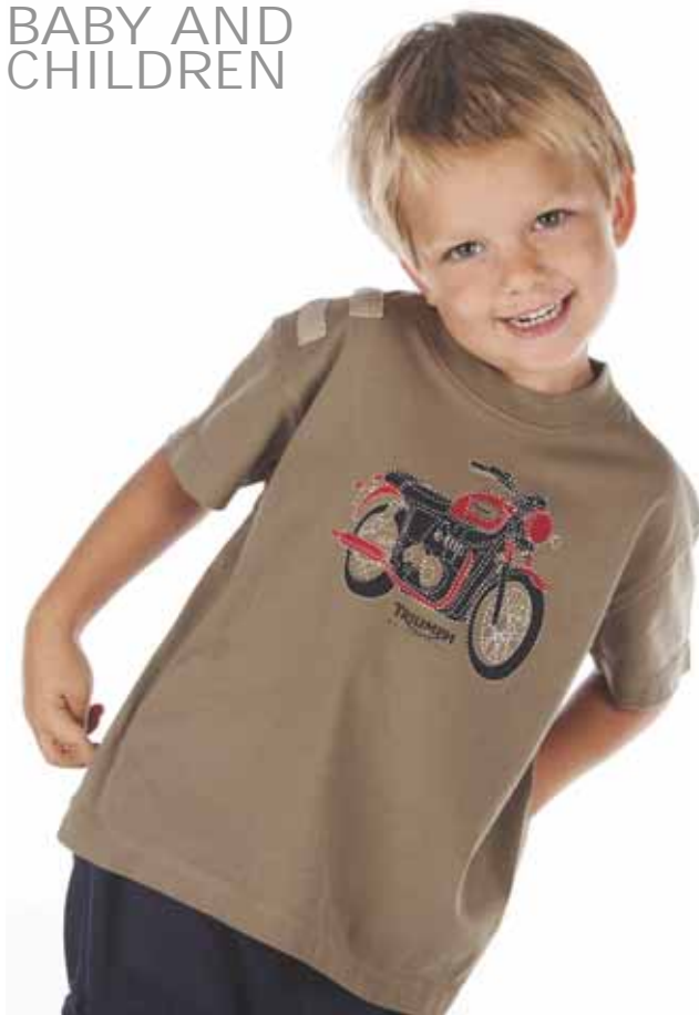
STITCHED BIKE Green