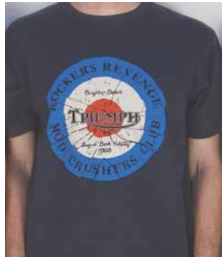
MOD CRUSHERS CLUB Navy Sizes S - XXL INT