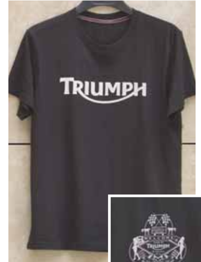
FABULOUS HINCKLEY Black Sizes S - XXL INT