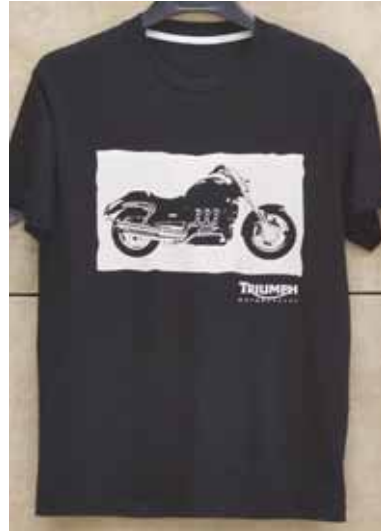
ROCKET III #5 Black Sizes S - XXL INT