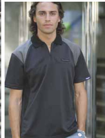
RAT TRI-DRI POLO SHIRT Black/Grey