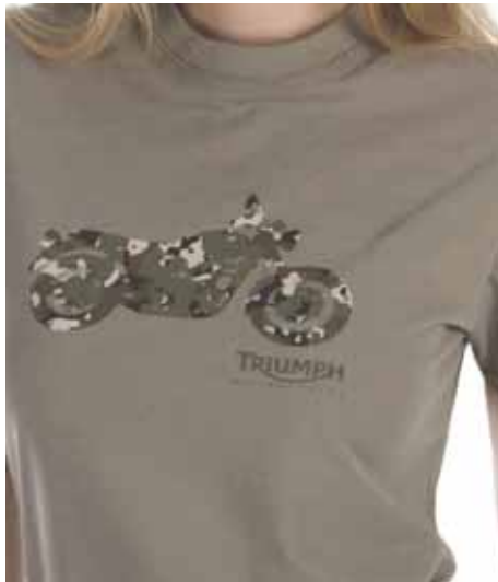
CAMO BIKE Green Sizes XS - 3L INT