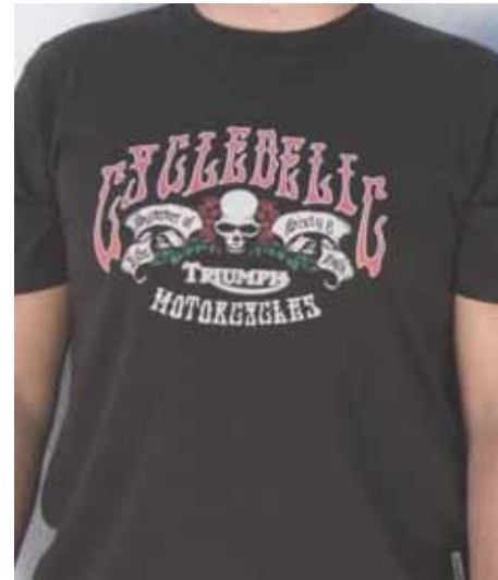
CYCLEDELIC Black Sizes S - XXL INT