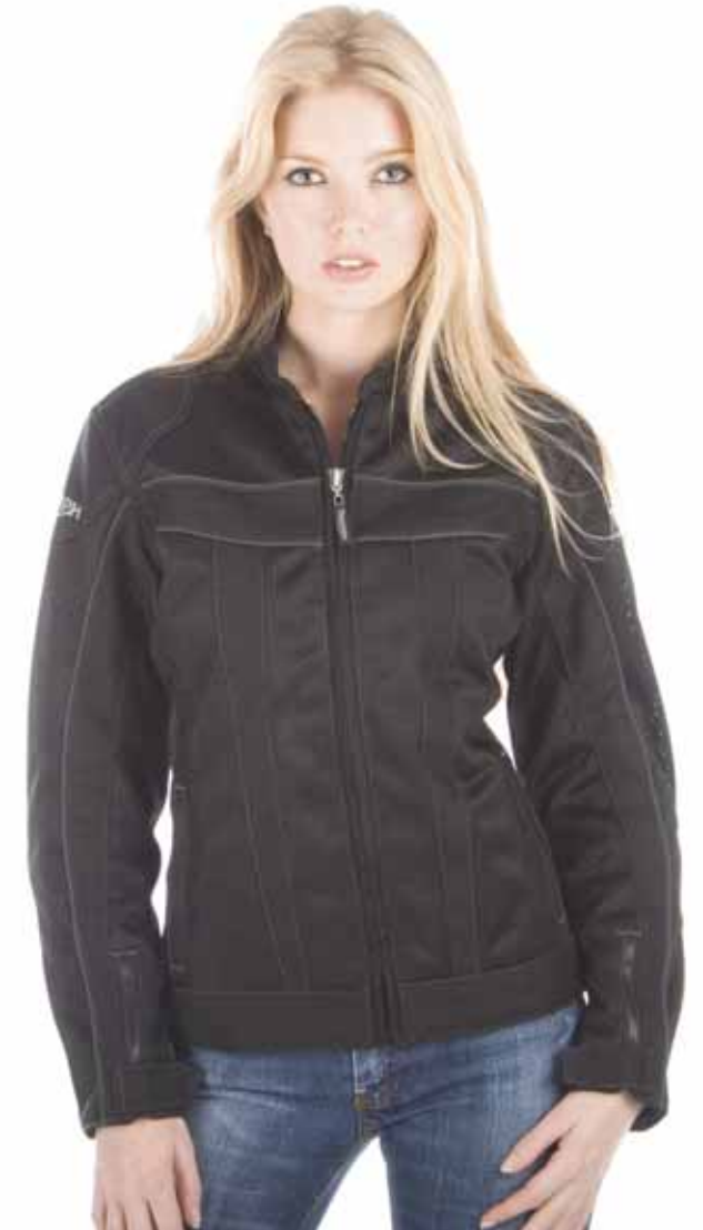
URBAN SPORT RAPTOR #2 MESH JACKET Fully perforated mesh panels and Hitena® construction* Easily removable CE95 shoulder and elbow protectors Windproof and water resistant removable liner Removable dual density back insert 3M® night reflective piping Waist connection zipper supplied Sizes XS - 3L INT