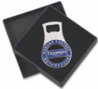
BOTTLE OPENER #2