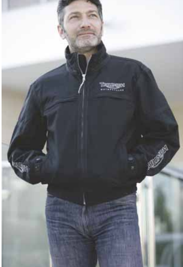
TEAM TEAM BLOUSON Water repellent outer fabric Large embroidered back logo Sizes S - XXXL INT