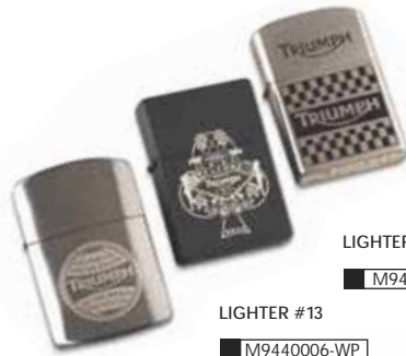
LIGHTER #12 M9440006-FH