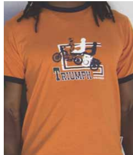
FLYING BIKE Orange Sizes S - XXL INT