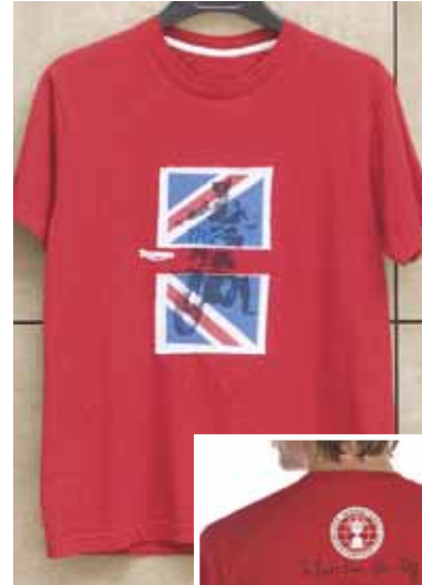
SCRAMBLER Red Sizes S - XXL INT