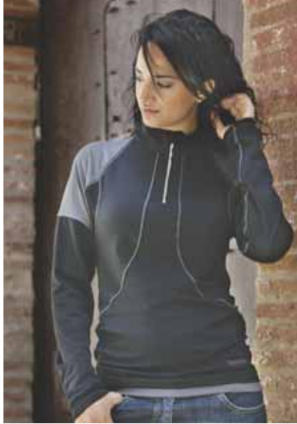
RAT TRI-DRI LADIES PERFORMANCE TOP Black/Grey