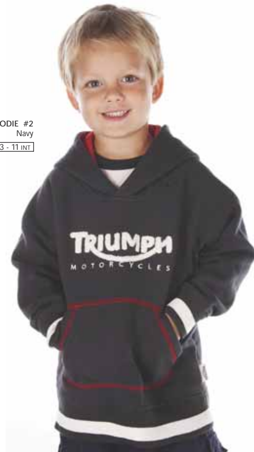
HOODIE #2 Navy