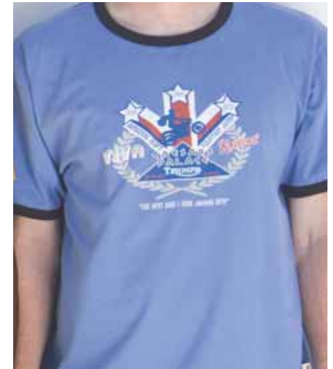
VIVA KNIEVEL Blue Sizes S - XXL INT