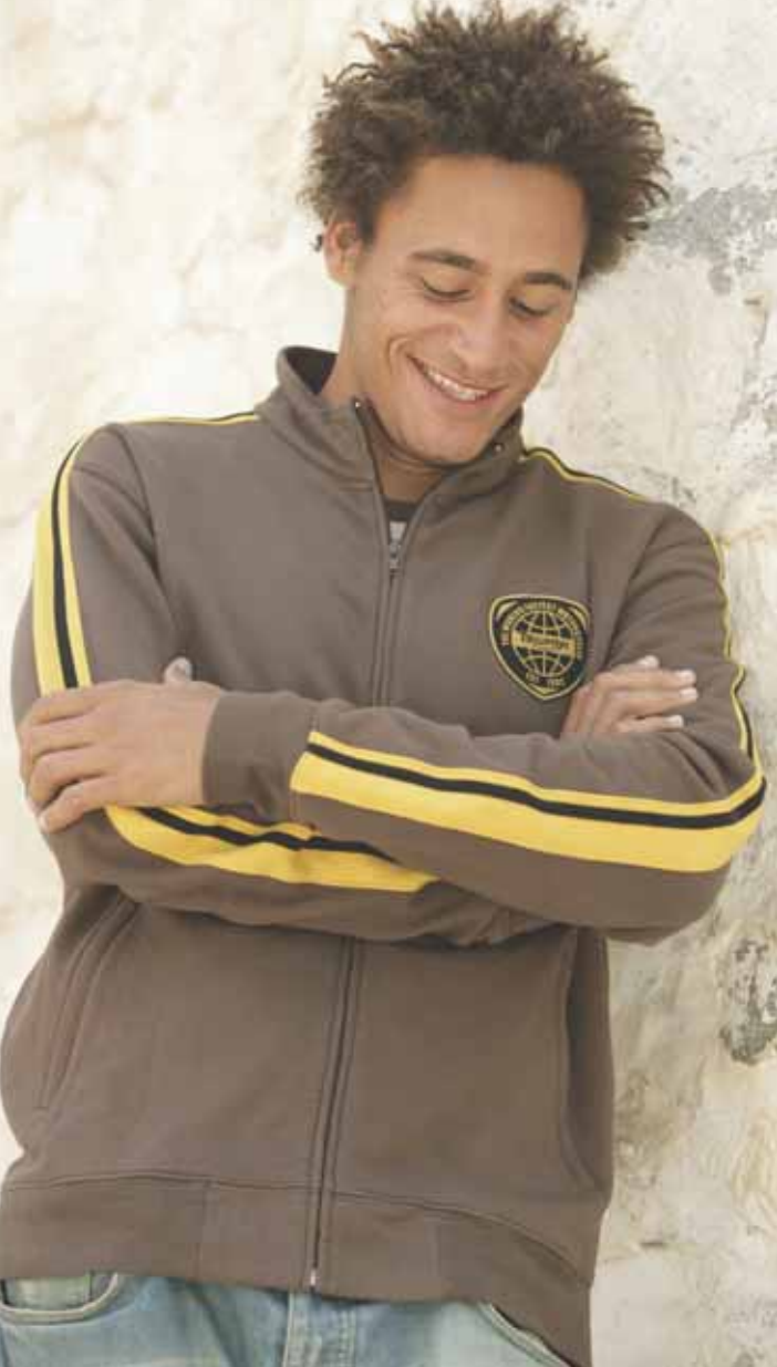
BROWN ZIP THRU Brown