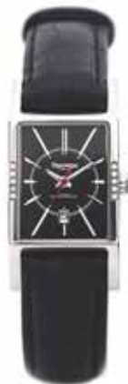
LADIES STAINLESS STEEL WITH DIAMONDS 8 full cut diamonds pieces on bezel Black leather strap 5 ATM