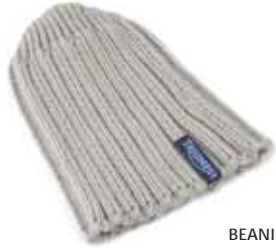
BEANIE ECRU M8801308