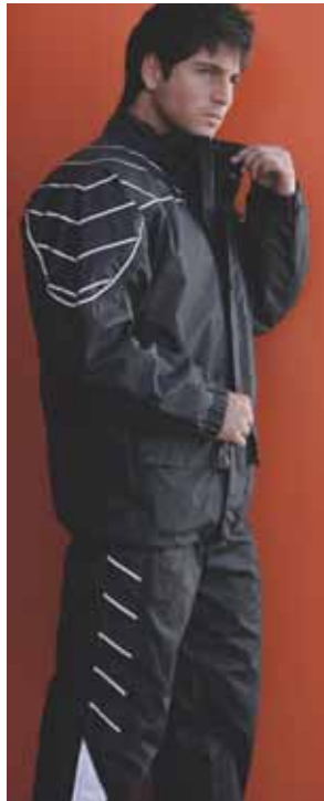
RAIN CHEVRON 2 PIECE OVERSUIT Waterproof nylon fabric 2 large storage pockets on jacket 3M® night reflective chevron shoulder design Ankle to knee length zippers Jacket and pants available separately