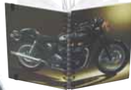
A5 NOTEBOOK BONNIE