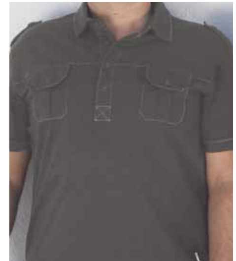
POCKET POLO Black